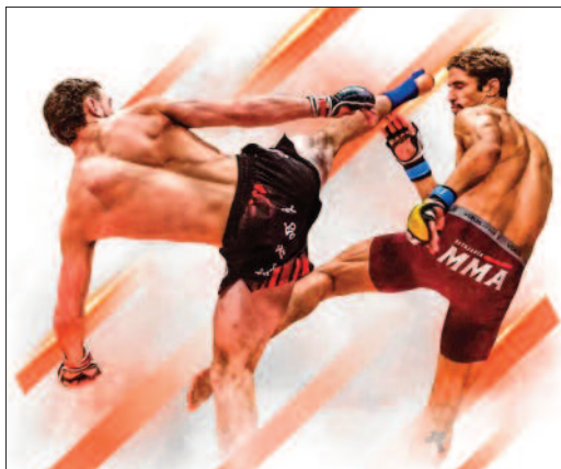
Caged Steel 43, Doncaster Dome

Featuring some of the region's biggest combat stars, this professional event offers an explosive showcase of skill, athleticism, and non-stop sporting drama. General admission tickets start from £40 for adults.