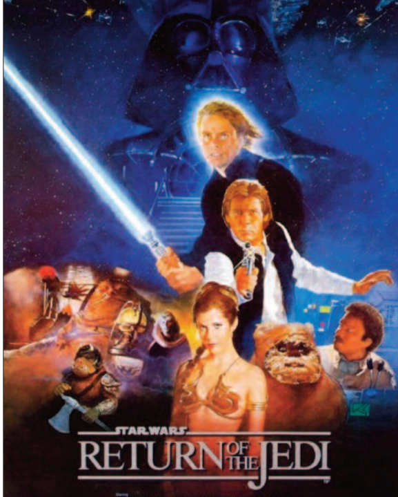
Return of The Jedi, Lakeside Village Shopping Outlet

Chris Moyles Live After Racing, Doncaster Racecourse, gates open at 11:20am (First race at 1:20pm). The Meadowhall Summer Saturday Series presents a brilliant blast from the past! Settle in for an afternoon of live horse racing followed by a 90-minute outdoor "90s Hangover" DJ set from broadcasting legend Chris Moyles. The Radio X breakfast host will serve up tunes of the decade, from Blur to Britney, and Pulp to the Prodigy. The entertainment kicks off on the Champagne Lawn 10 minutes after the final race. Access to the music performance is exclusive to County, Premier, and Hospitality ticket holders. Guests must be aged 13 or over to access the lawn, and under 18s must be accompanied by an adult. Tickets start from £10.