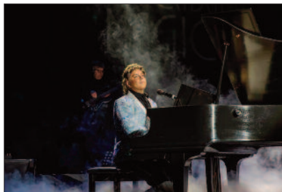
Copacabana Magic - The Barry Manilow Show, Doncaster Dome