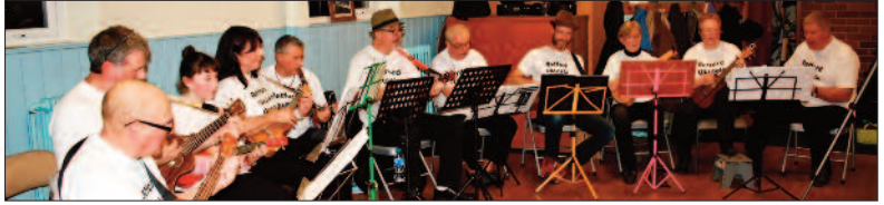
Retford Ukulele Group.

A vibrant lineup of regional musicians -- ranging from ukulele bands to skiffle groups -- is providing the soundtrack to a vital support network for local families affected by dementia.