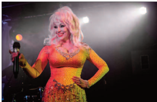
The Dolly Show, Majestic Theatre, Retford

worked as Dolly's official body double), this theatrical concert features a spectacular live band and chronicles Dolly's musical legacy from the 1960s to the modern day. Blending flawless vocals with heartfelt storytelling, quick wit, and signature country warmth, Kelly wows audiences with Jolene, 9 to 5, Islands in the Stream, and Coat of Many Colours. Recommended audience age 14+.