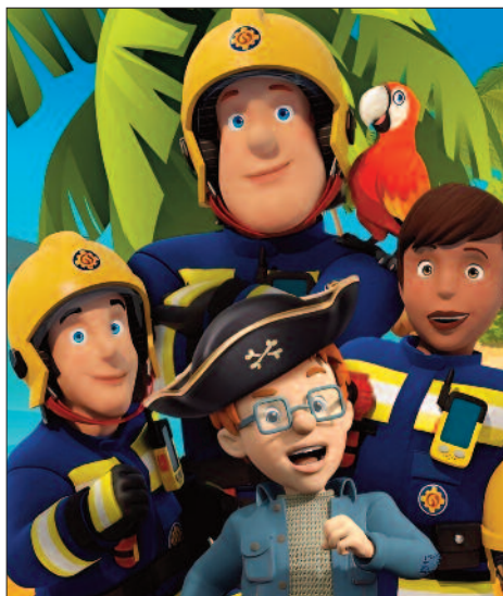
Fireman Sam - The Lost Pirate Treasure, Majestic Theatre

Fireman Sam - The Lost Pirate Treasure, Majestic Theatre, Retford, 12:30pm (Doors open at 12:00pm). A swashbuckling live musical treat for the little ones! When the mischievous Norman Price goes exploring deep into the Pontypandy caves to try and win the local treasure hunt, he unexpectedly uncovers a real pirate secret. It's up to Fireman Sam, Elvis, and Ellie to save the day. Strobe lighting and theatrical smoke may be used. Recommended audience age 3+.