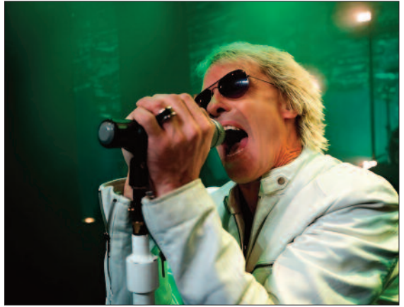
The Bon Jovi Experience, Cast Theatre, Doncaster

Dinner and Quiz Night Fundraiser, Café Flourish (Woodfield Park, Balby), 6:30pm (7:00pm start). Assemble your ultimate trivia team and support a wonderful community cause! Café Flourish is back with its highly popular quiz evening. Tickets are £9.50 per person and include entry into the quiz alongside a delicious dinner of homemade lasagne served with warm garlic bread. Hot drinks, soft drinks, and fresh cakes will be available to purchase on the night. Teams are a maximum of 5 people.